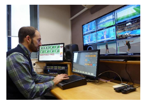
Figure 3 Voice Over booth with no fader controls required. Simplified operation can be managed by the presenters.

As already described, auto surround Upmix can be used to maintain a constant surround experience independent of the format of the source audio. The use of adaptive Auto-EQ is another technique to ensure the consistency of spectral balance and that all important speech intelligibility.