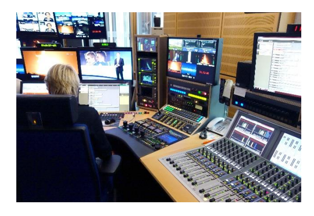
Figure 1. One operator taking control of both video and audio in automated live production

The loudness control process will balance the audio energy in accordance with the appropriate standards and recommendations and if the prelevelling is done correctly, then the loudness control can operate in a much more gentle and unobtrusive way.